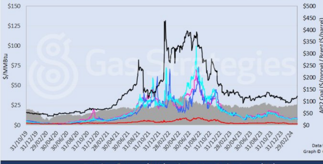
EU carbon allowances (EUAs) on the Emissions Trading System (ETS)